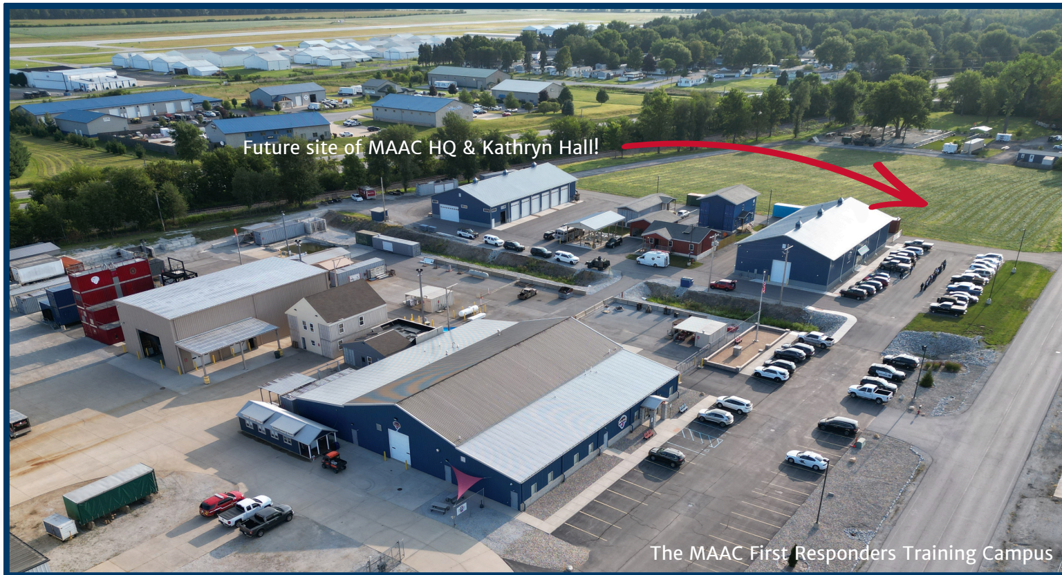
Future site of MAAC HQ & Kathryn Hall!

In less than 10 years, the MAAC has grown from a single building into a 30-acre, fully-comprehensive first responder training campus. With over 40 buildings, structures, and specialized training areas, the MAAC serves more than 100 unique departments, including firefighters, police officers, and EMTs, at no cost to them or their agencies. Because of supporters like you, we have hosted over 110K responders at our state-of-the-art facility, offering training spaces they can't find anywhere else.